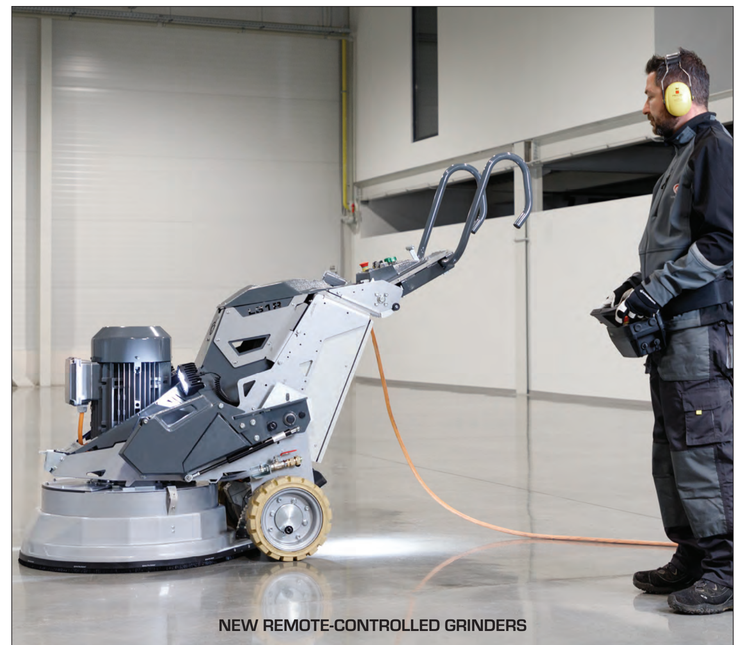
NEW REMOTE-CONTROLLED GRINDERS