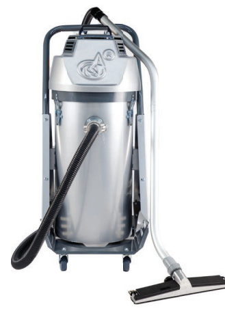
NEW! V16E DRY & WET VAC (115V or 220V)