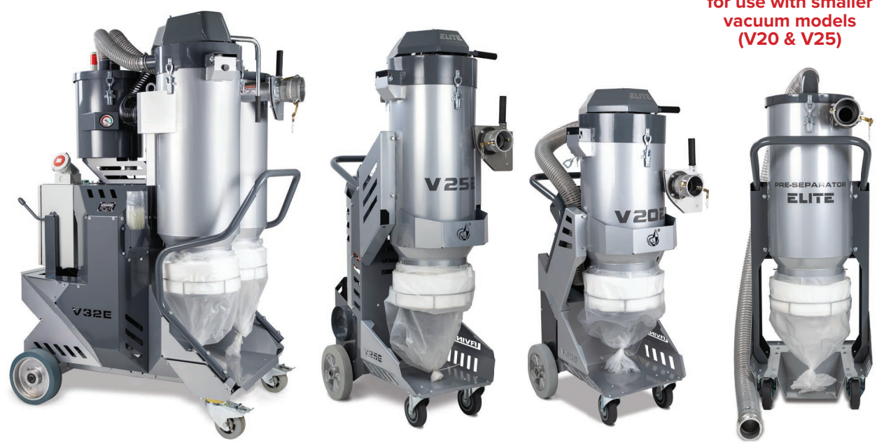
Dust Pre-Separator for use with smaller vacuum models (V20 & V25)