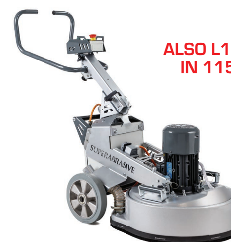
ALSO L19S7 IN 115V