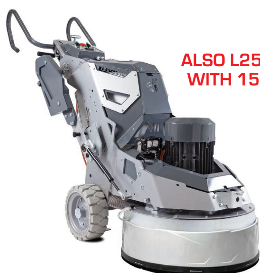
ALSO L25LS7 WITH 15 HP