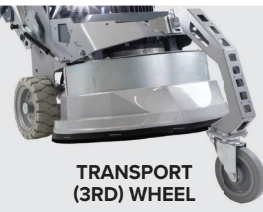
TRANSPORT (3RD) WHEEL